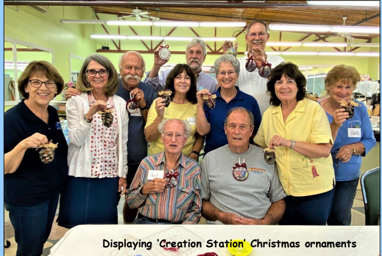
Displaying 'Creation Station' Christmas ornaments