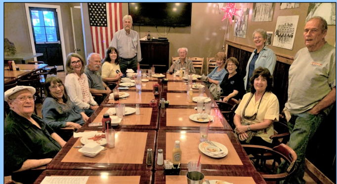
Dinner at 'Chomp'