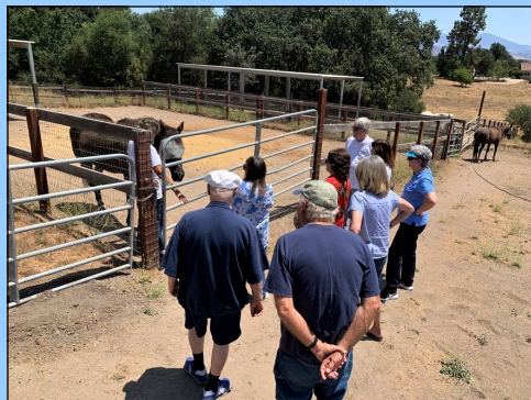
Visiting 'Happy Endings' Rescue Ranch