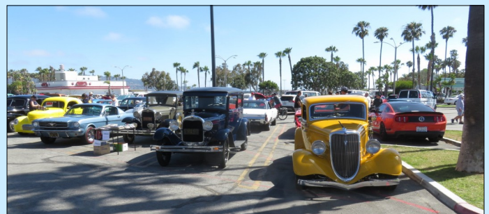
Friday afternoon at Ruby's Diner Redondo Beach