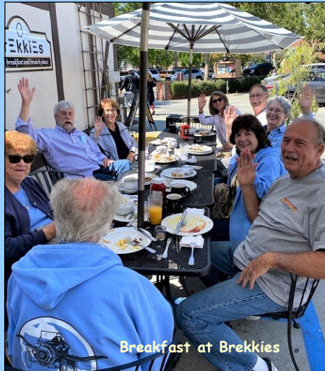
Breakfast at Brekkies