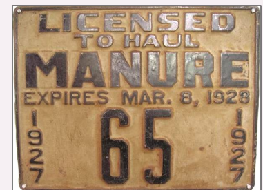
Vintage license plate seen recently in Washington DC