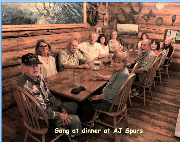
Gang at dinner at AJ Spurs