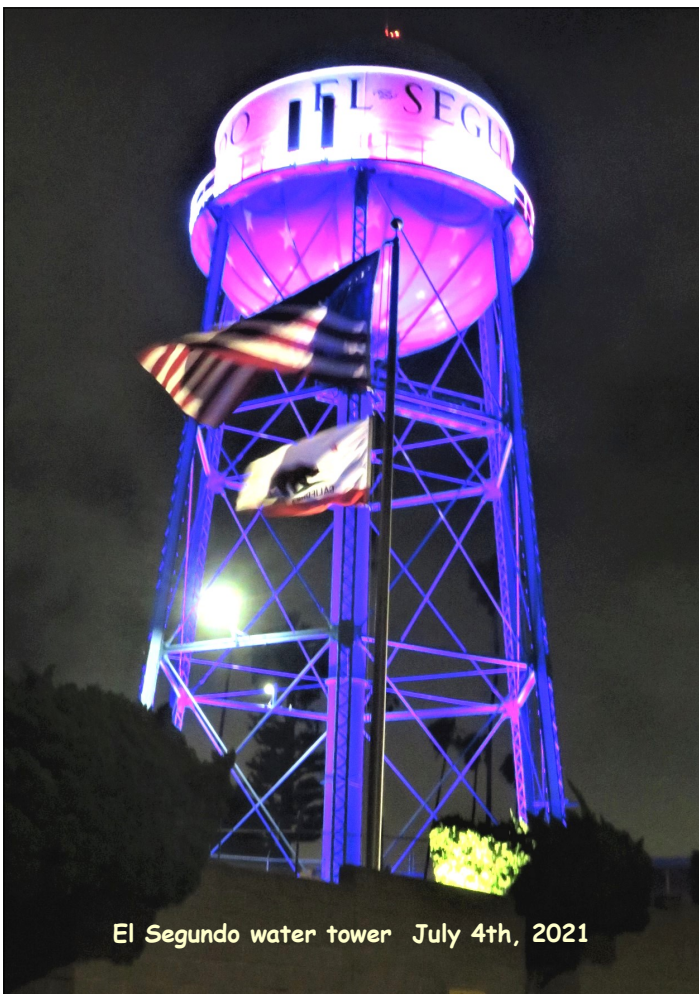
El Segundo water tower July 4th, 2021